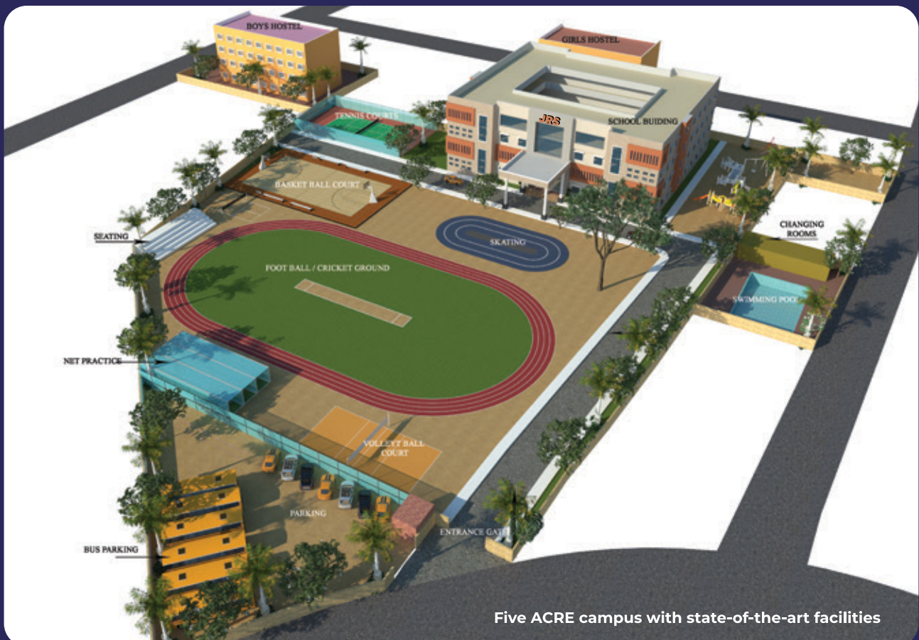
Five ACRE campus with state-of-the-art facilities

www.linkedin.com/in/jrs-internationalschool-6913851a1